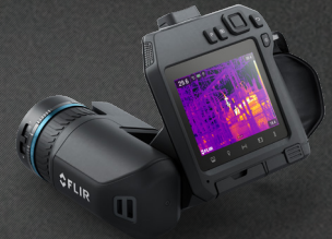
FLIR T-Series™ with FlexView™ Dual FOV Lens