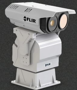
FLIR FH-Series™ PTZ