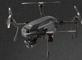
SIRAS™ with FLIR Vue® Pro R Payload

FLIR thermal imaging and AI-driven inspection systems provide real-time situational awareness, detecting intrusions, unauthorized activity, and overheating equipment. From aerial surveillance with thermal drones to AI-powered vehicle inspections that identify critical tire damage—such as rock cuts—FLIR technology ensures