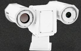
FLIR PT-Series HD™

"Thermal imaging cameras have proven their worth here in Oranjemund.", continues Mr. Groenewald. "They are an excellent tool for spotting activity in total darkness and in harsh weather conditions. Thermal imaging provides us with other options as well. At Namdeb we are trying to work in an ecological friendly way. If a mining area is mined out, we rehabilitate the area to its original state. Although sometimes fences are necessary, we try to avoid them as much as possible. We are investigating thermal imaging to further assist us with perimeter protection. This may reduce the civil works cost for expensive fencing options."