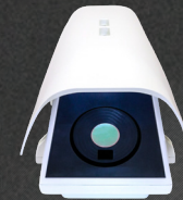
FLIR A500f/ A700f™