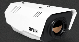
FLIR FC-Series AI™