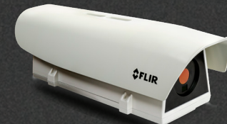
FLIR A500f/ A700f™

Rope shovels, haul trucks, and conveyor systems are essential for material transport in mining, but continuous use puts immense strain on mechanical components. Failing bearings, overheating motors, and hydraulic leaks can all result in costly downtime and inefficiencies. With FLIR cameras, maintenance teams can quickly identify excessive heat buildup in bearings and motors, and pinpoint leaks in hydraulic systems before they cause operational failures. Proactively detecting these issues helps extend equipment lifespan and maintain peak