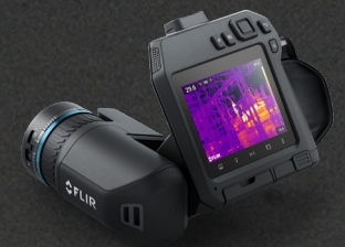
FLIR T-Series™ with FlexView™ Dual FOV Lens