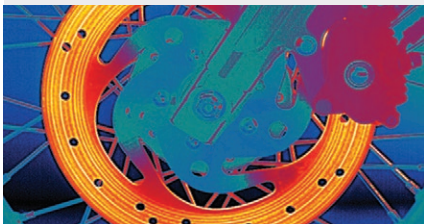
Motorcycle break testing.